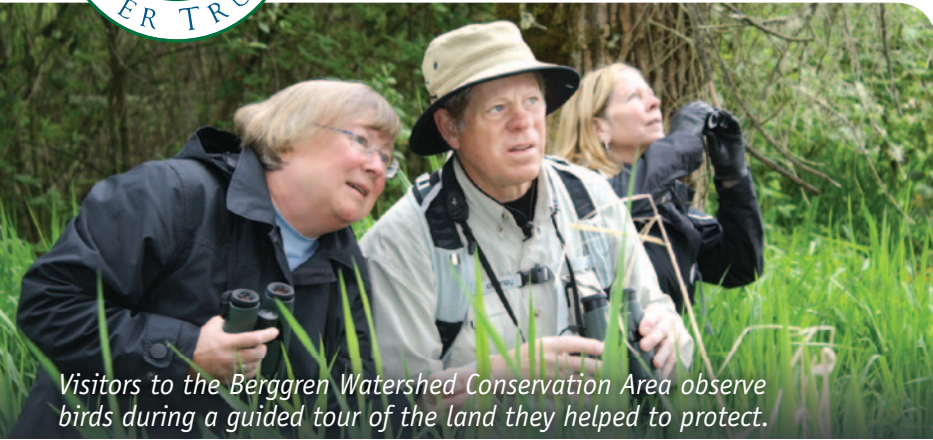
Visitors to the Berggren Watershed Conservation Area observe birds during a guided tour of the land they helped to protect.