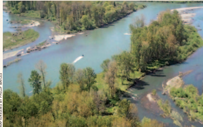
RAPTORNEWS BY PHILIP BANILES

The Willamette River continues to meander at Green Island.